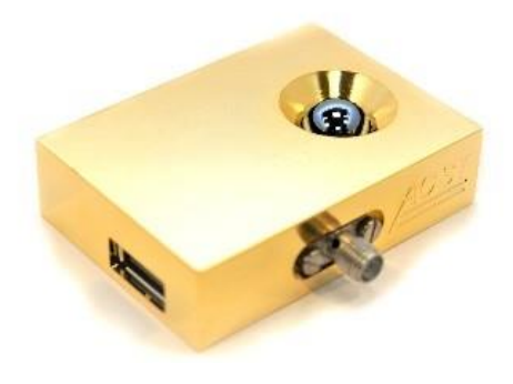
Fig. 1: Optical view of the product

Bias-free operation allows for system simplicity and ultra-low noise. In contrast to typical THz detectors, the ACST SBD solution is simpler, geometrically smaller, and much faster.