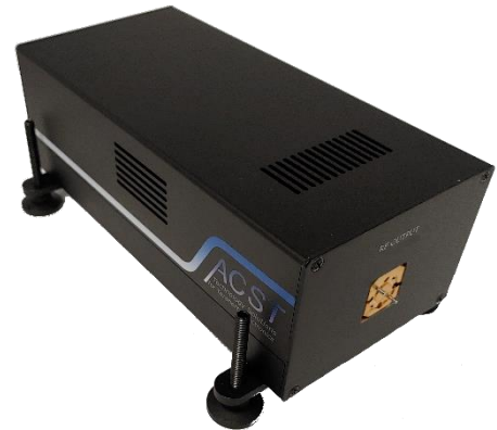
Fig. 1: Optical view of the product

The source is fixed tuned and does not require any adjustment for proper operation. All required voltage biases and current sources are provided by a dedicated power supply unit, which only needs a standard AC power. A TTL modulation port and/or an user-controlled attenuator can be integrated on customer request.